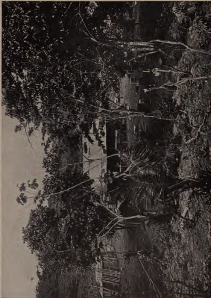
A Suburban Dwelling